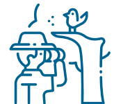
6 BLUEBIRD TRAIL STARTING POINT