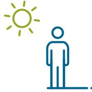
1 HUMAN SUNDIAL