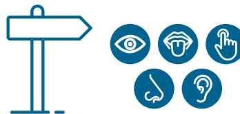
9 SENSORY FOOTPATH