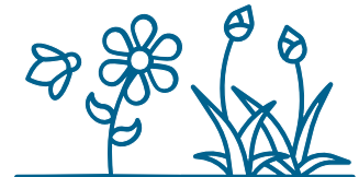
8 POLLINATOR HABITAT