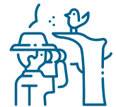
6 BLUEBIRD TRAIL STARTING POINT