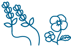
10 EDIBLE FLOWERS