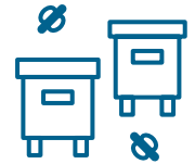
4 "APIARY" BEE HIVES