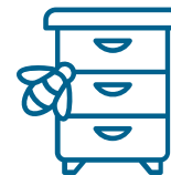
7 BEE HOTEL